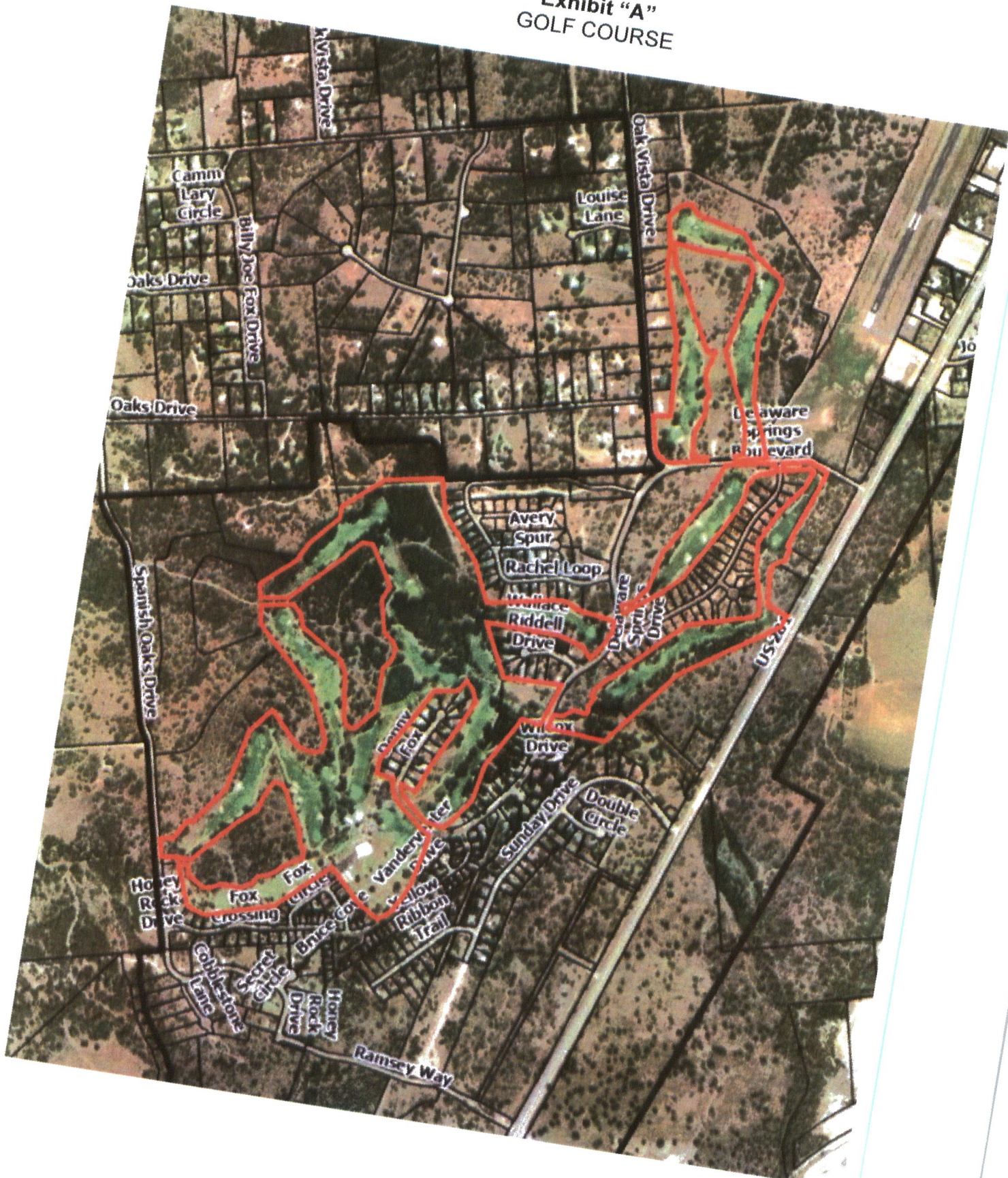
Exhibit "A" GOLF COURSE